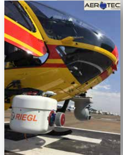
mounting example on a helicopter (EC135) for power line mapping/inspection