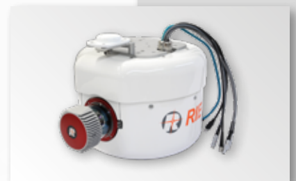
RIEGL VP-1 Helicopter Pod with GNSS antenna mounted

Further details to be found on the current RIEGL VUX-1LR Data Sheet.