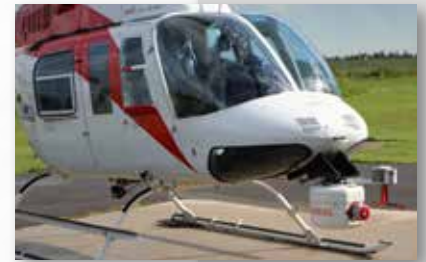
mounting example on BELL Long Range Helicopter

Further details to be found on the current RIEGL VUX-SYS Data Sheet.