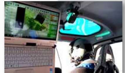
system operation and data acquisition with RiACQUIRE